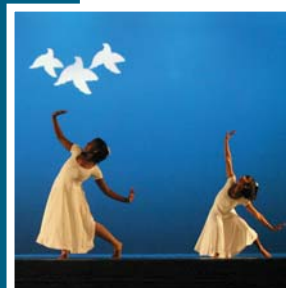
AND THE ARTS AWAIT.