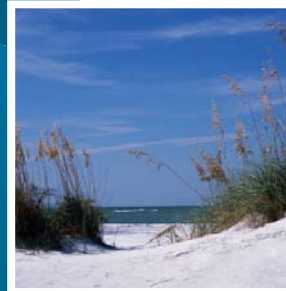
WE'RE CLOSE TO BEACHES

to learn more about Tuomey Healthcare System