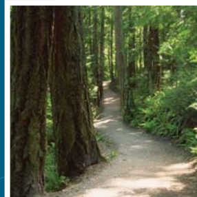
NATURE TRAILS ABOUND